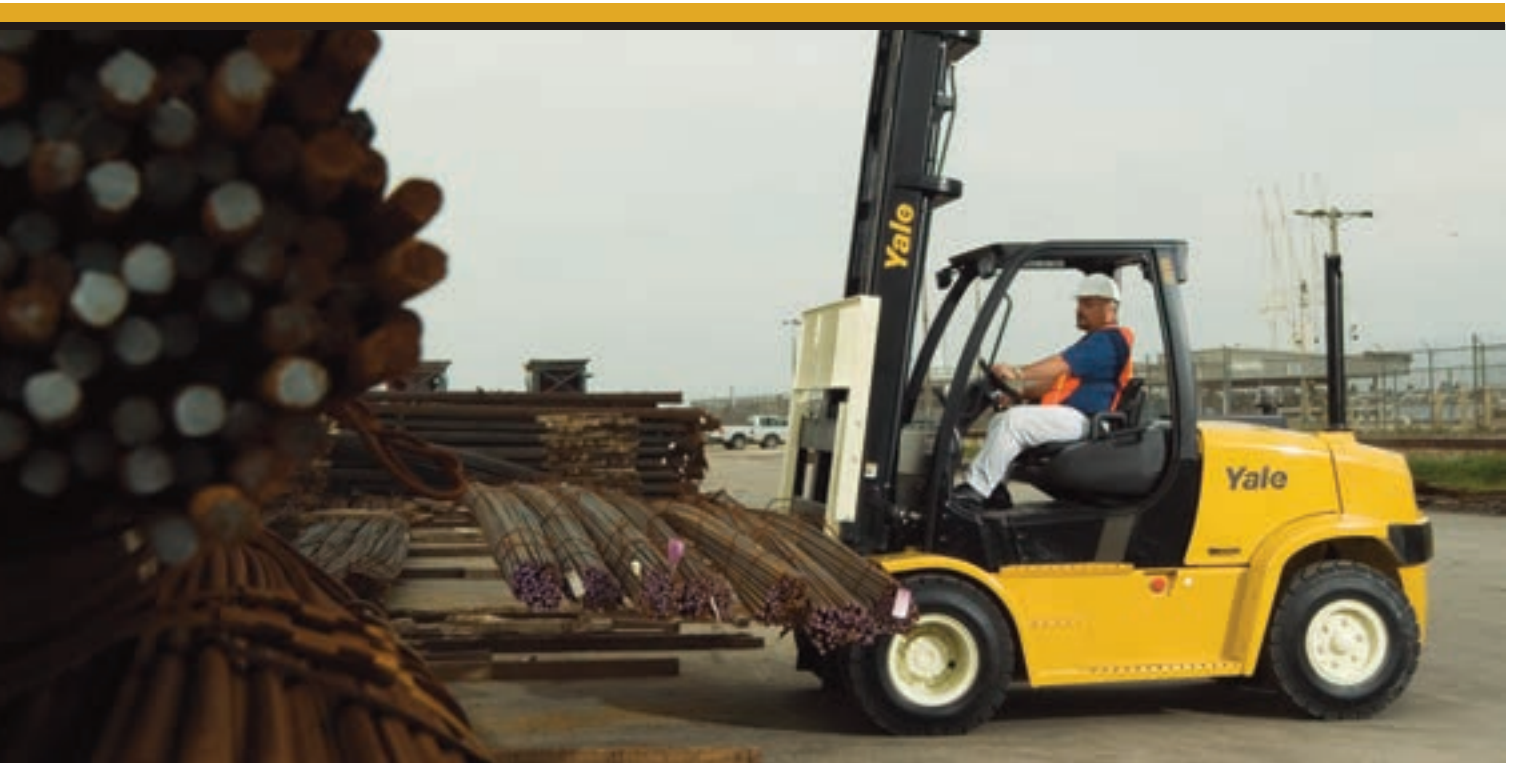
All trucks shown with optional equipment

Various configurations are designed to meet and exceed your specific application requirements. The Yale Veracitor® VX Series productivity cost savings are achieved through lower truck operating expenses, reduced labor costs, reduced operator overtime expense and additional savings with increased throughput. The combination of engine and transmission options allows you to configure a truck to your specific applications. These trucks help achieve savings through reduced labor costs and reduced operator overtime.