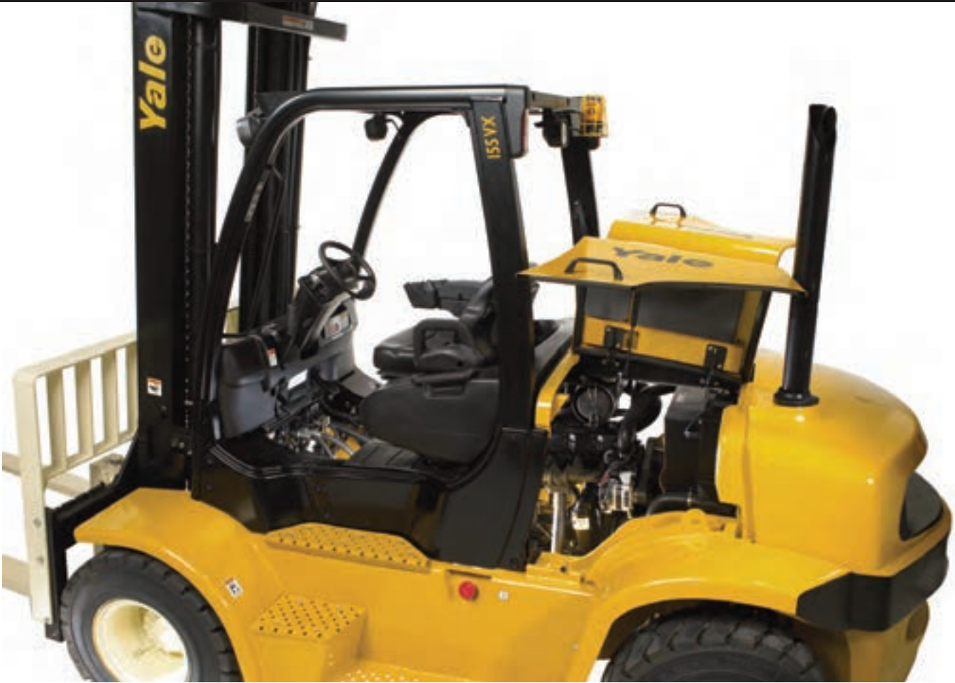
All trucks shown with optional equipment

Not only is the Veracitor® VX series designed to require less maintenance, it is also designed to be extremely easy to service. From the gull-wing engine covers and on-board diagnostics, to the reliable, most comprehensive parts availability in the industry, these trucks were designed with service details in mind. It's the new standard in truck serviceability.