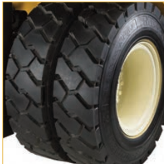
Increased tire life

Yale has improved serviceability of the Veracitor® VX series and reduces the labor cost involved with periodic maintenance and unscheduled repairs. Simplified daily checks and reduced service requirements lead to lower maintenance costs.