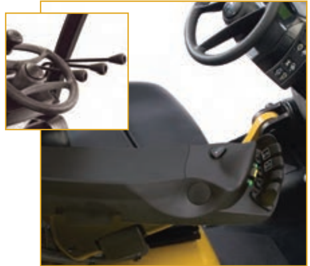
Ergonomic hydraulic controls

A low step height provides easy entry and exit. The standard, cowl-mounted manual hydraulic levers also allow easy access for right-side entry/exit. Yale's overhead guard design also offers plenty of headroom with excellent visibility even at higher fork heights.