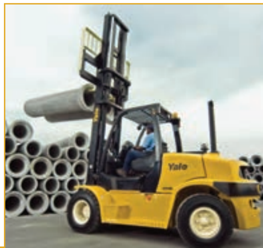
Reduced labor costs