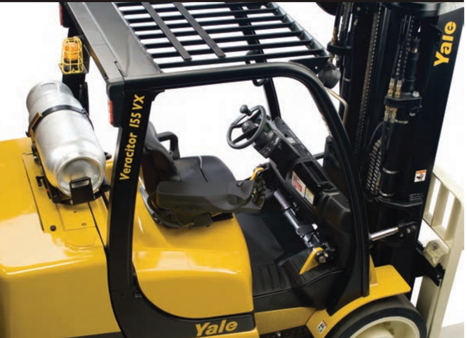
All trucks shown with optional equipment

Operators prefer our trucks. Operator comfort is enhanced by the increased foot space in the well designed operator's compartment. The isolated powertrain reduces noise and vibration minimizing operator fatigue and increasing operator productivity throughout a shift. Excellent operator visibility is afforded through the Yale Hi-Vis™ mast.