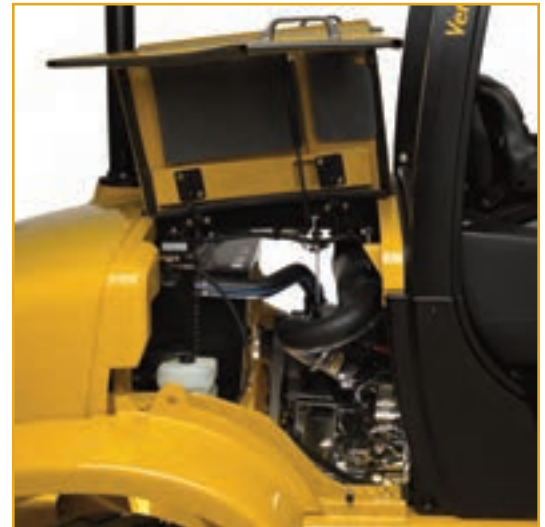
Excellent service access

The Intellix VSM, vehicle systems manager, continuously monitors truck functions and immediately alerts the operator to service needs. Extensive on-board diagnostics on the Veracitor® VX trucks advanced dash display communicates service codes enabling quick and accurate repairs .