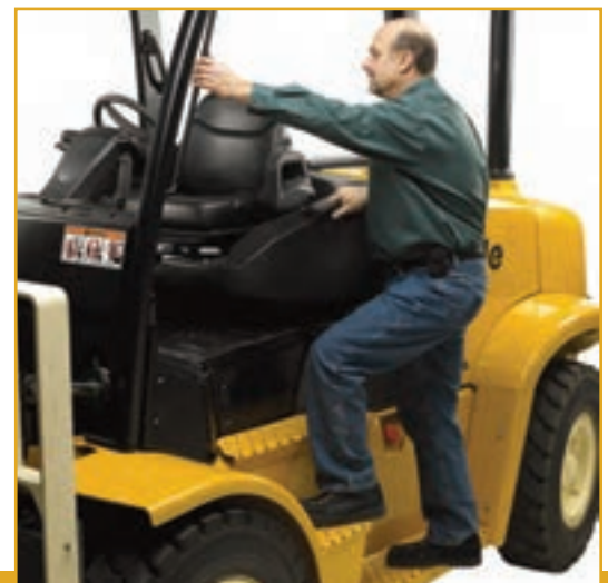
Low step height