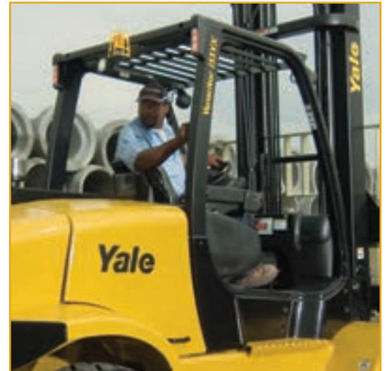
Rear driving comfort