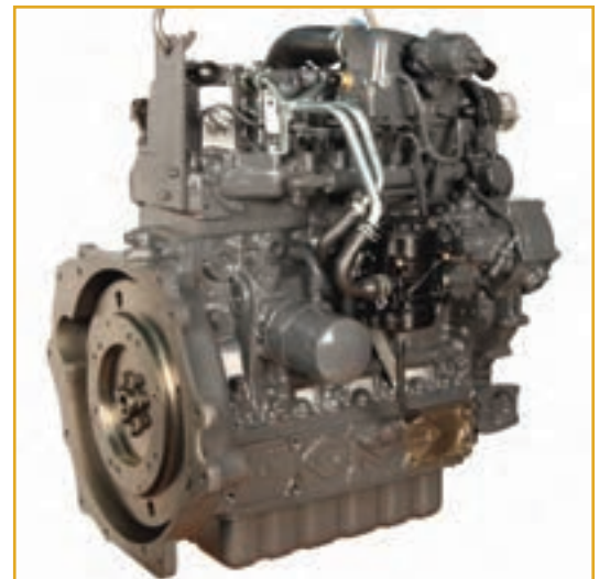
Kubota 3.8L EPA Certified Tier 4 final turbo diesel Engine