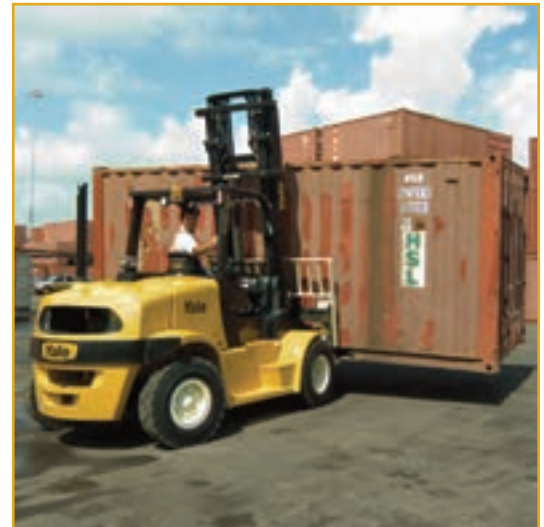
Various truck configurations

The optional Techtronix 332 transmission features controlled ramp descent , limiting roll to three inches per second, electronic inching (requires no adjustment), and the Auto Deceleration System , bringing the unit to a complete stop when the accelerator pedal is released. Tire spin is reduced by precisely regulating engine speed during controlled power reversals .