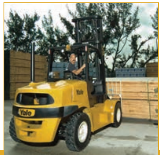
Auto Deceleration System