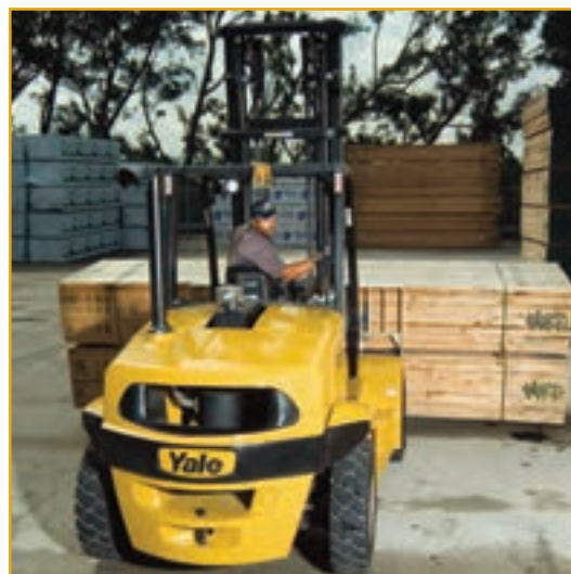
Controlled direction changes