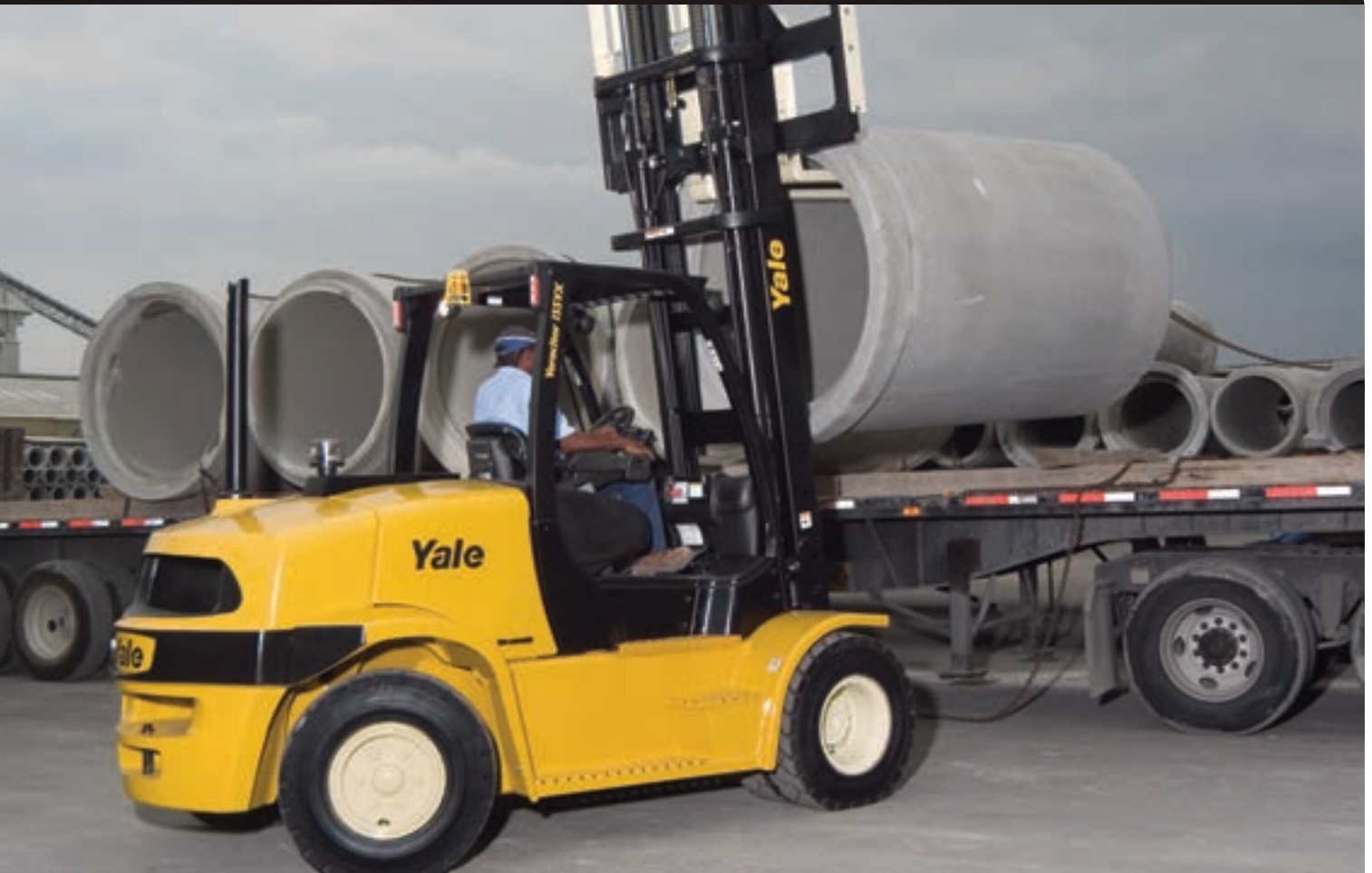
All trucks shown with optional equipment

As a leader in materials handling, Yale ® offers so much more than the most complete line of lift trucks. Yale has invested heavily in people, processes and capital equipment to encompass the cornerstones of quality and dependability... Innovative Design, Comprehensive Testing, Highest Quality, Advanced Components and Superior Manufacturing.